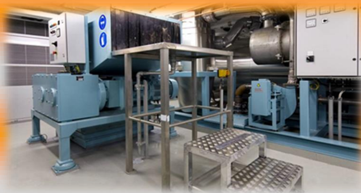
Heavy Duty Shredder