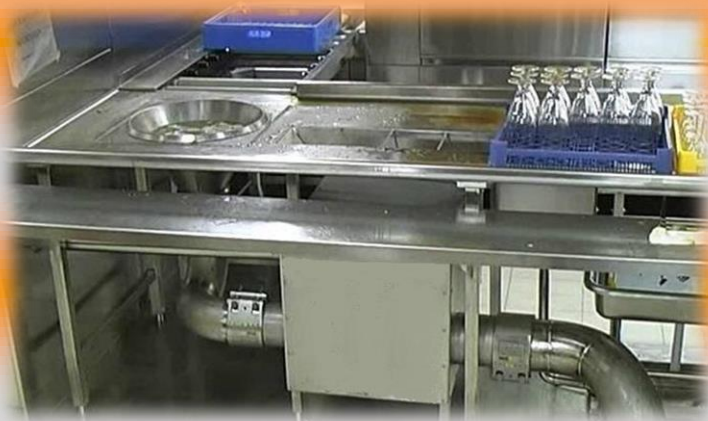
Food Waste Vacuum Transport System